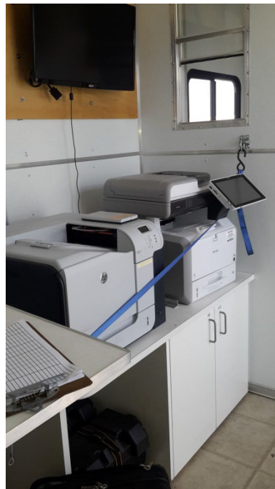
Equipment in Search & Rescue Command Post Trailer

Medical Equipment - up to 23 lbs. Store at 30 inches high