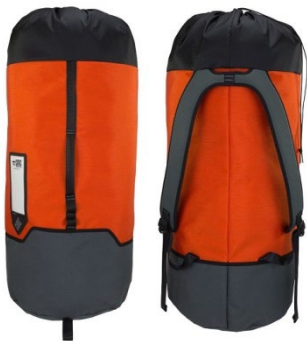
Pack of Rescue Ropes- 300 ft. = 18 lbs.