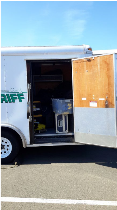
Search & Rescue Supply Trailer