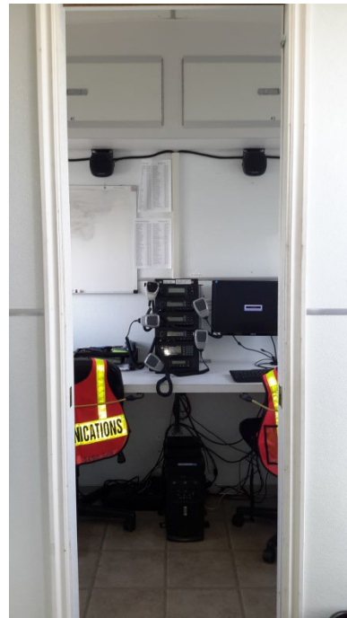
Communications Room of Search & Rescue Command Post Trailer