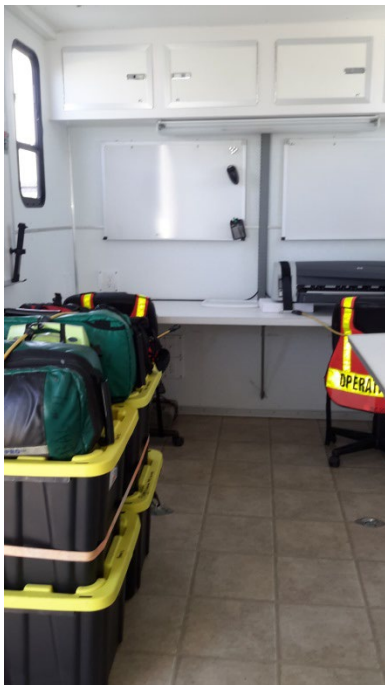
Medical Equipment and Supplies In Search & Rescue Command Post Trailer

Medical Equipment - up to 23 lbs. Store at 30 inches high