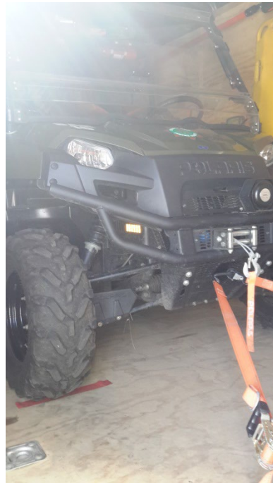
Search & Rescue ATV