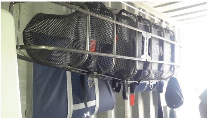
Rescue Litter – 31 lbs. empty; 2 to 6 person carry with patient