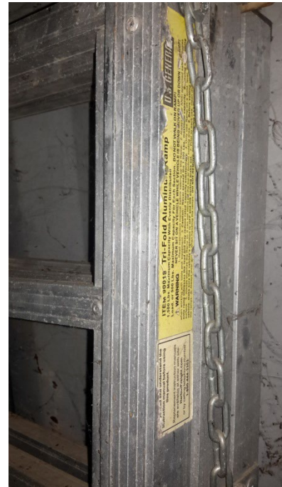
Tri-Fold Aluminum Ramp- 30 lbs.