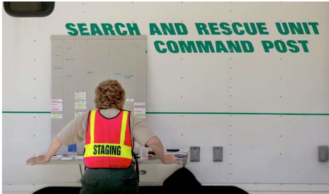
Search & Rescue Command Post Trailer