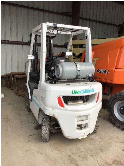
Propane fueled Forklift Tank lifted up to 47-inches