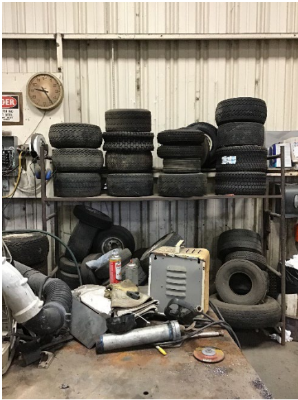
Golf Cart Tires – 20 lbs. Stored from floor to 76 inches