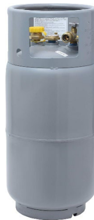
8 Gallon/33.5 lbs. Propane tank Tank = 33.5 lbs.-Empty; 71 lbs.- Full