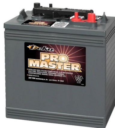
6 Volt Golf Cart Battery 10" x 7" x 11" = 58 lbs.