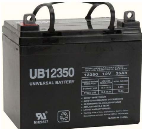
12 Volt Golf Cart Battery 8" x 5" x 6." = 13 lbs.