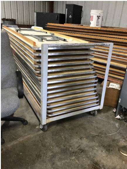
Set-Up/Break-Down of Events- 8' x 30" table – 61 lbs. 15 – 8 ft. tables with handle at 42" Push force = 46.37 lbs. / Pull force = 59.37lbs.