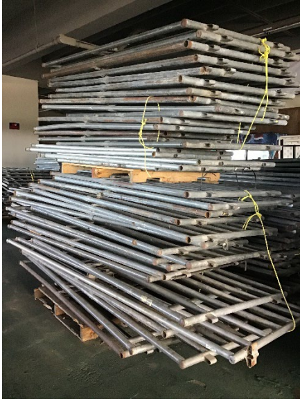
Small Livestock Portable Pens Moved around grounds on pallet by Forklift