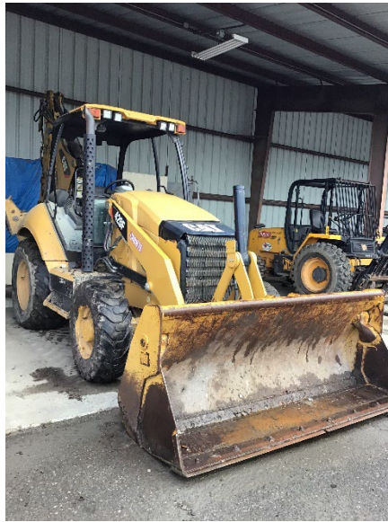
Sample of equipment to be maintained/repaired