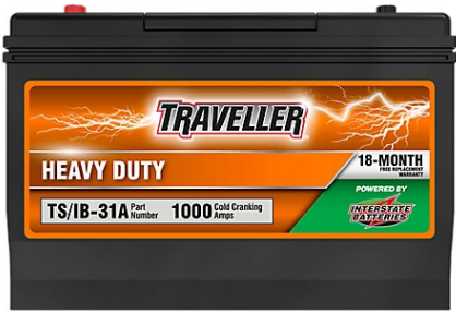
Truck/Tractor Battery 9.5" x 13" x 7" = 58.5 lbs.