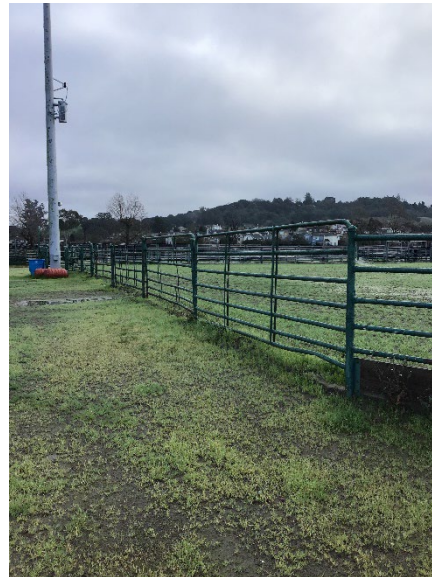
Powder River Gates and Panels One panel weighs up to 153 lbs. *Two-Person or Mechanical Lift ONLY*