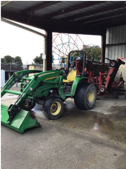
Sample of equipment to be maintained/repaired